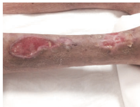
FIGURE 4: After 2 weeks of EBS treatment and standard dressing.