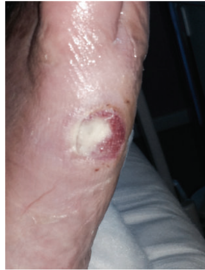
FIGURE 7: Wound epithelization after 10 days of EBS treatment.

A skin examination performed at the time of admission showed a foot ulcer of about 2.5 cm involving the fascia, and it was evaluated as grade II according to the Wagner grading system (Figure 6) [11]. An X-ray of the foot was performed and showed no occurrence of osteomyelitis.