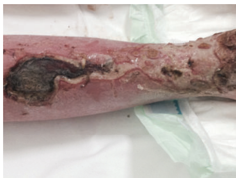
FIGURE 2: Initial gangrene of the lower limb at admission.