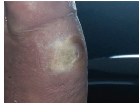
FIGURE 8: Complete diabetic ulcer healing at discharge.

In the last two decades there has been an increasing interest in the PEMF for the management of ischemic, pressure, and venous ulcers. The basic mechanisms underlying EMF are not clear. PEMFs are low frequency fields with very specific shape and amplitude. They can be applied in