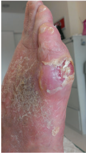
FIGURE 6: Foot diabetic ulcer at admission.