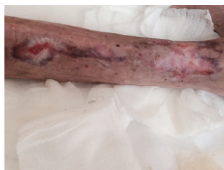
FIGURE 5: Skin ulcers completely heal after 5 weeks.

and showed extensive right leg ulcers. These lesions had a necrotic appearance, without granulation tissue, and were covered by purulent exudates (Figure 2).