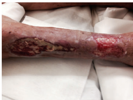
FIGURE 3: Seven days after EBS treatment and standard dressing.